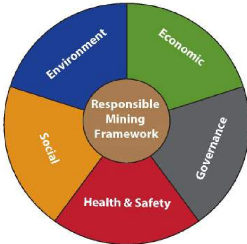
FIGURE 1: VISUAL SUMMARY OF OUR RESPONSIBLE MINING FRAMEWORK

The five elements along with the strategic areas of focus identified in Figure 1 are the foundation of our commitment to strengthen corporate accountability, keep our employees and local communities safe, respect and preserve the natural environment, understand and mitigate social and community impacts, and enhance stakeholder engagement and communications.